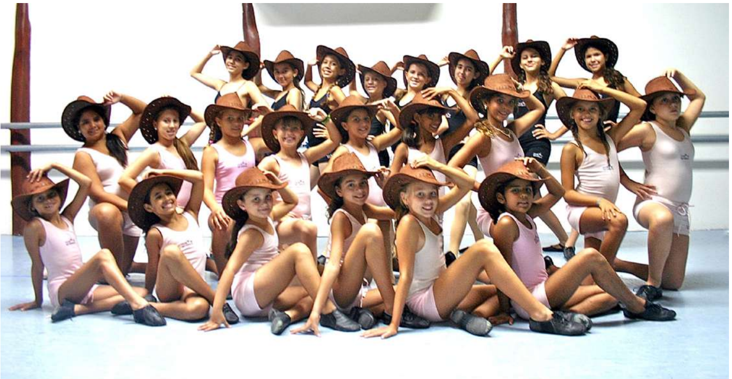
Jazz Beginners and Basic