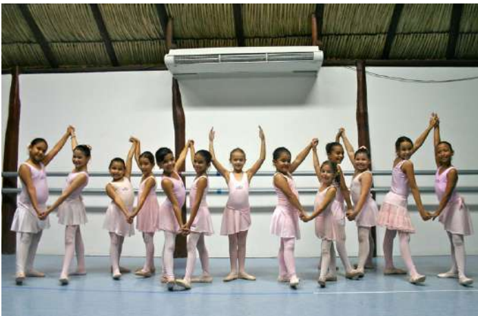
Ballet Beginners and Basic