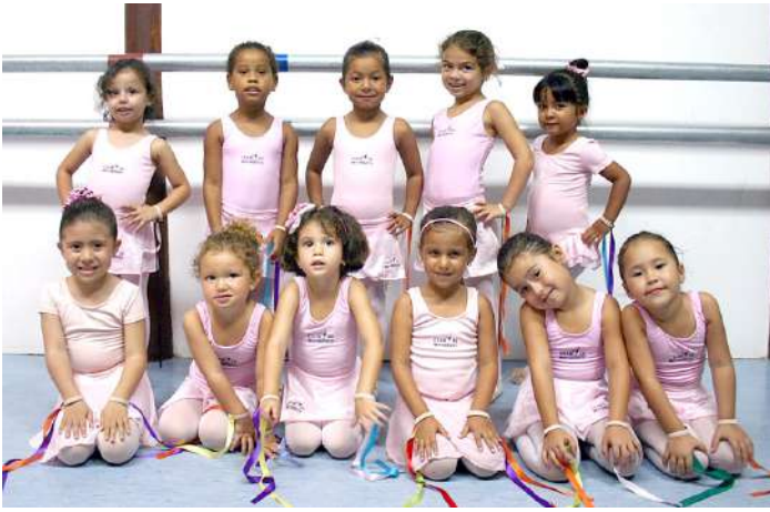
Baby Class 1