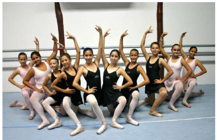
Ballet Basic 3 and Intermediate 1