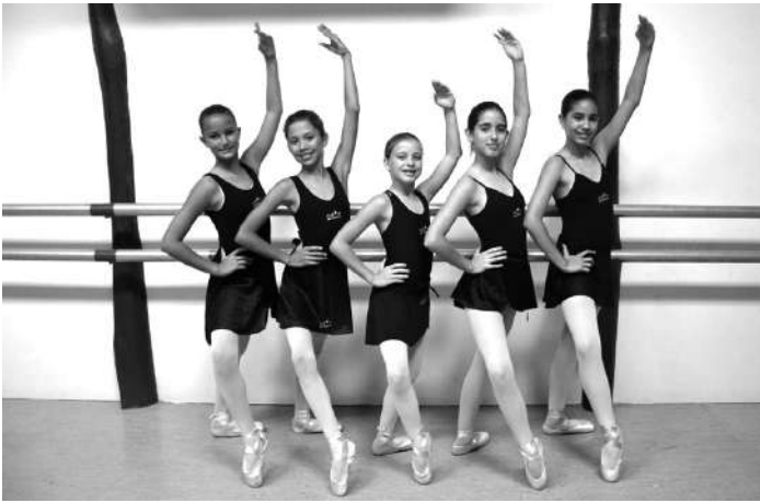
Ballet Intermediate 1 Points