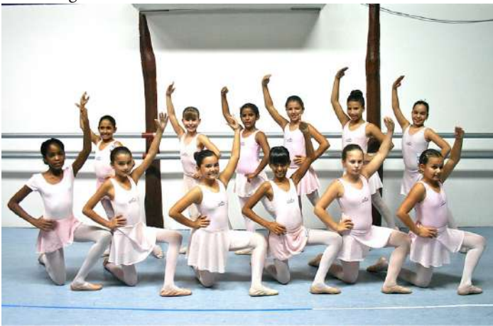
Ballet Basic 2 and 3