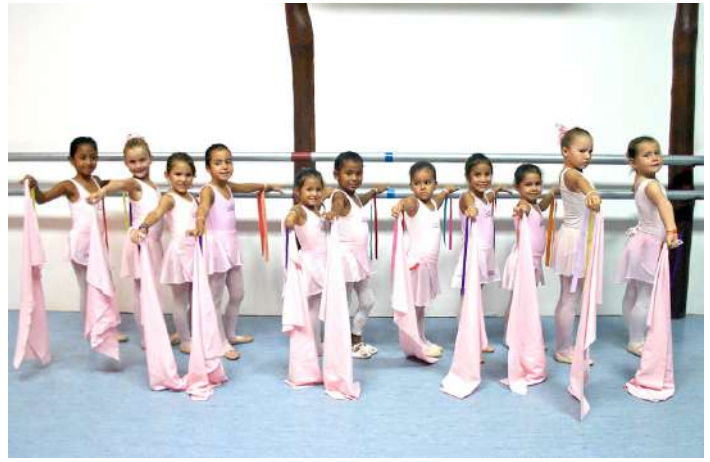
Baby Class 2