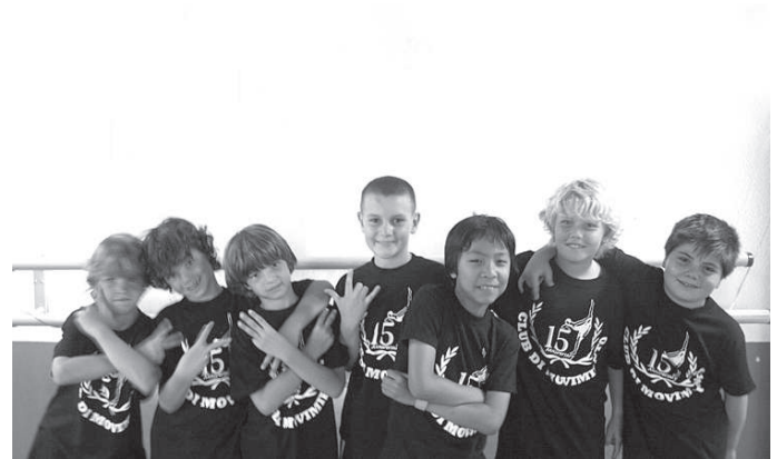
Street Dance Boys