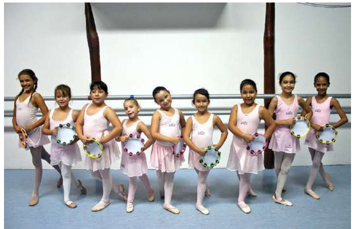
Ballet Basic 1 and 2