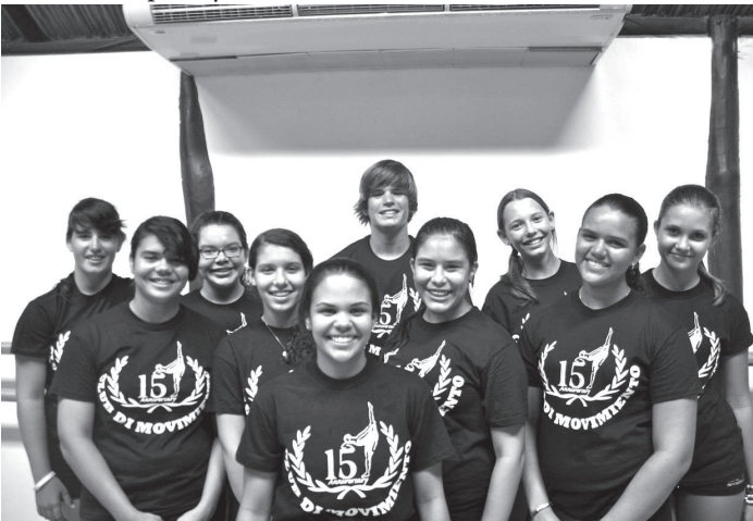
Street Dance Teens